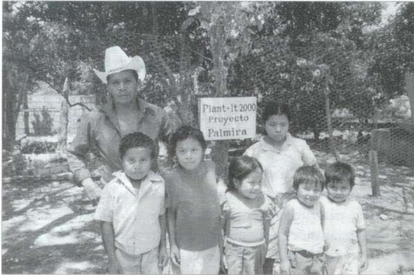
Above - Tree-planting villagers in Honduras who assist with the tree-planting

Plant-It 2000 regularly engages in international tree-planting projects that not only help the forest environment but also people. In nineteen ninety three, we planted twenty five thousand trees in Honduras. This event not only eliminated the cycle of drought and flooding affecting many villages but also assisted in the