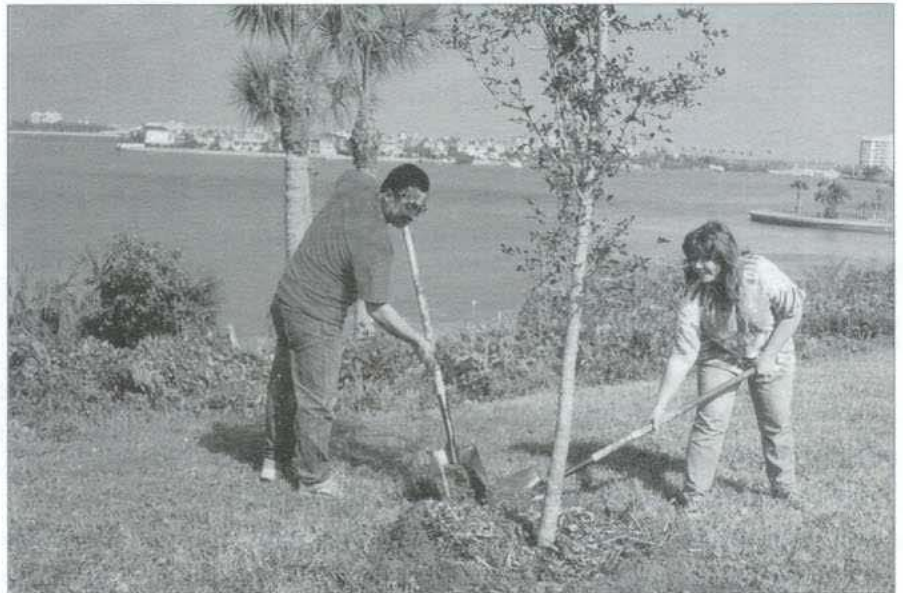
Above— One of the trees being planted at Howlette Park, Bellair, Florida