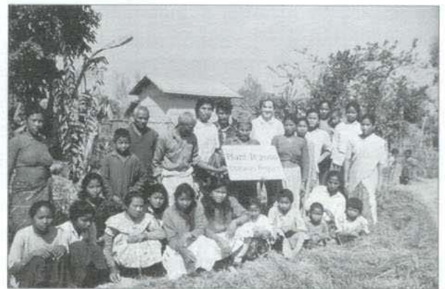
Above - Nepalese Tree-planters from a local village

Last year, we planted one hundred and five thousand trees in areas within Kenya and Uganda. This project generated a great deal of food, helped restore underground water aquifers and reduced drought in many villages. Twelve towns participated in the tree-planting