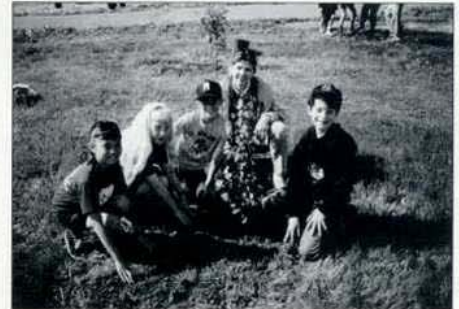
Top Left: Senator David Ralston of Georgia Assists Plant-It 2000 For the Last Two Years By Planting Trees in Georgia. Top Right: Students Planting Our Trees in Davis, California.

Printed on recycled paper with soy-based inks.